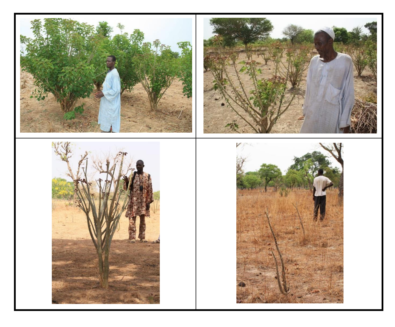
Figure 2: Differences in plant size among 3 years old plantations in the villages of Zena, Kita, Tandio and Douna. 2011.

The majority of the Jatropha farmers initially identified by project lists and interviewed through focus groups were unsuccessfully cultivating the crop and only a small share of them (the ones selected for household questionnaires and in-depth interviews) had kept their crops alive in the first 3 years of plantation. Transect walks showed that there are significant differences in plant size and yields among different farmers (Figure 2). According to the farmers' perceptions assessed through in-depth interviews, size differences link to the fact that the young trees are often attacked by termites, while perceived soil fertility differences also play a role. In line with findings of Achten et al. (2010), Dyer et al. (2012) and Shanker et al. (2006), the results confirm that Jatropha yields are difficult to predict and the trees are subject to pests and diseases.