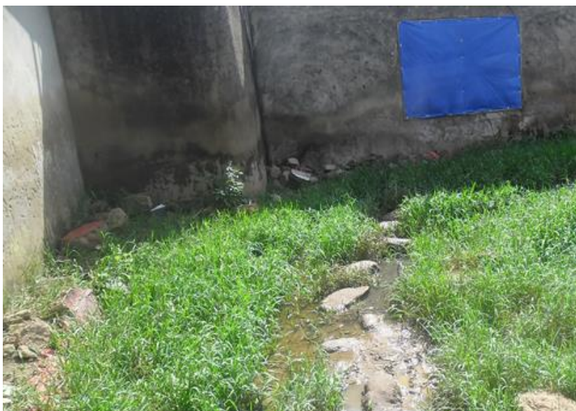
Fig. 2 Houses built on flood prone land

poverty, corruption and bureaucracy as important barriers. A tour around some of these areas revealed some houses sitting on pools of water (Fig. 2), buildings that were possibly approved without knowledge of the nature of the land or soil. Community members also indicated the presence of mosquitoes throughout the year because water from the bathrooms and domestic chores sits behind the houses and becomes a breeding ground. These areas are increasingly being used, putting human lives and property at risk as climatic hazards are expected to increase.